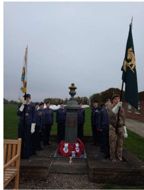
The Honour Guard at the memorial