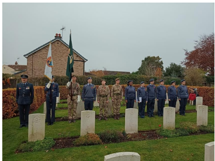
The Pocklington School CCF Honour Guard.