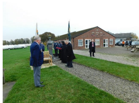
Pocklington TC wreath is laid.