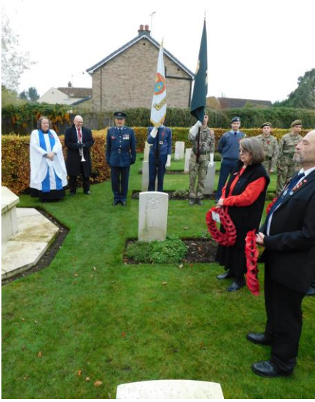
Barmby Moor PC wreath.