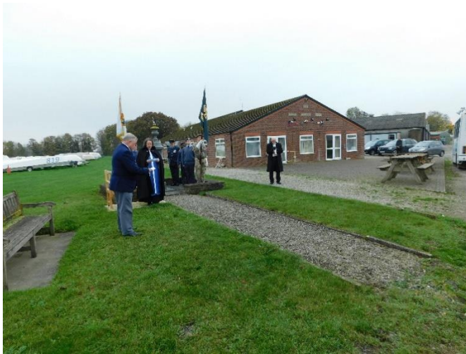
Our Chaplain leads our service.