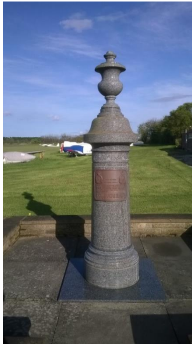
Royal Air Force - Pocklington Airfield

The home of 102 (Ceylon) Squadron RAF and 405 (Vancouver) Squadron RCAF No 4 Group Bomber Command during World War II from where so many gave their lives in the cause of freedom.