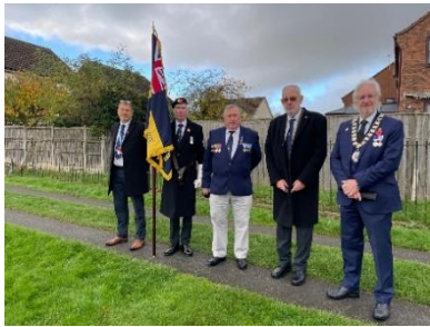
The formal party.

Following our duties at the 'G George' Memorial, we moved on to the Pocklington Burial Ground where we have seven Squadron aircrew interred.