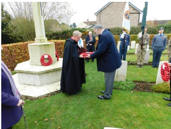
The District Council wreath.