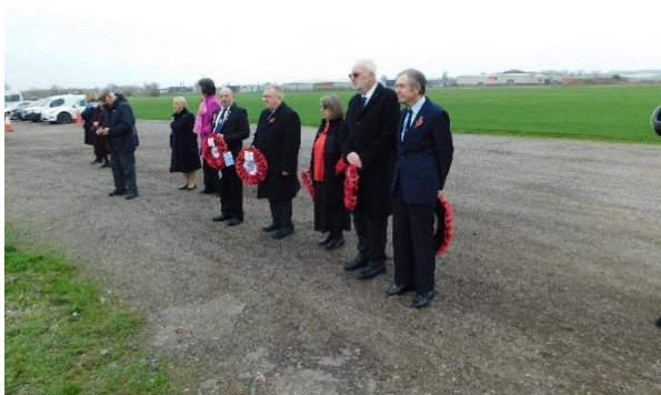
The Airfield wreath laying party.