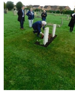
The Mayor lays our wreath