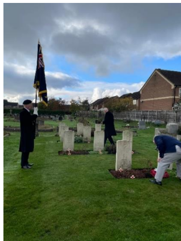
Individual remembrance crosses are laid on the graves.